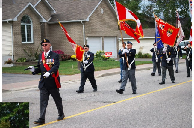
The Color Party is next