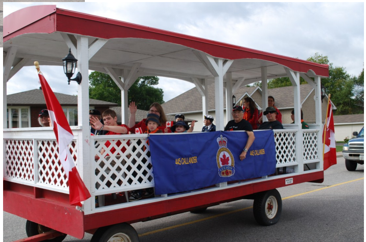
Some of Branch 445's Veterans were joined by 1st Callander Beavers and leaders