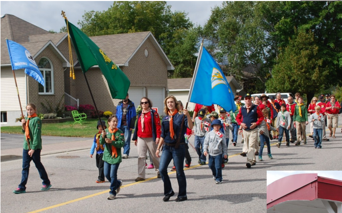
Local Scouting youth and leaders taking part in the parade