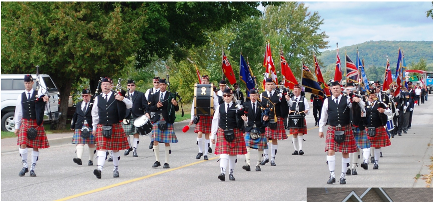
Pipe Band leading the Parade